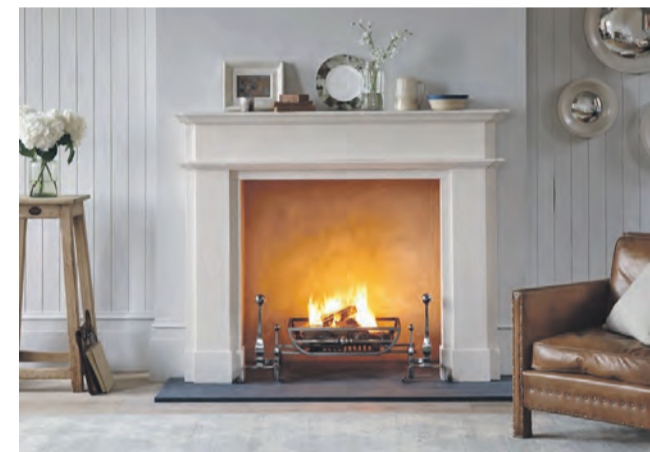
Always use a fireguard or spark guard when you use your open fire and ensure you dispose of ashes carefully.

For further information head to our website - https://www.fireandemergency.nz/winter-fire-safety/