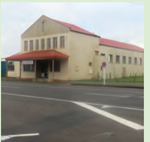
Manaia Hall no more. Page 13