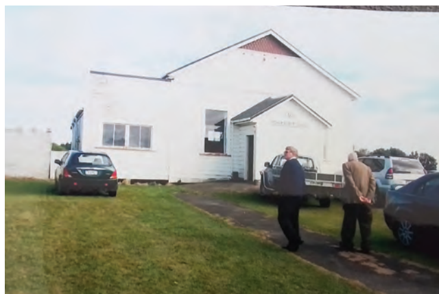
The Manutahi Hall in happier times.

metres away, the 124-year-old Pihama Hall suffered the same fate. Investigators have said there were no suspicious circumstances in either