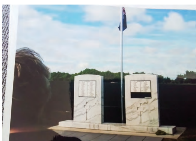
The Manutahi War Memorial.

would do likewise. They did, and so did he.