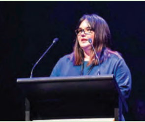
Stratford woman wins top non-fiction award. P 5.