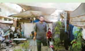
Wreath laid for Gaza. Pages 14, 15