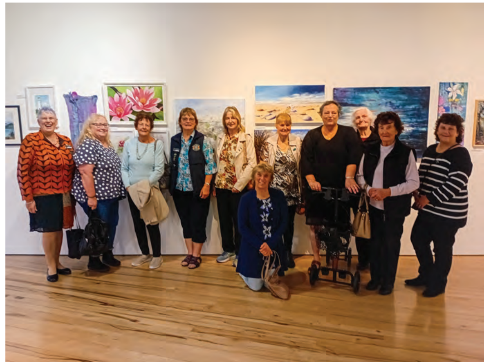
Riverlea WI members at the Percy Thomson Gallery.

We have some talented members and look forward to welcoming anyone who