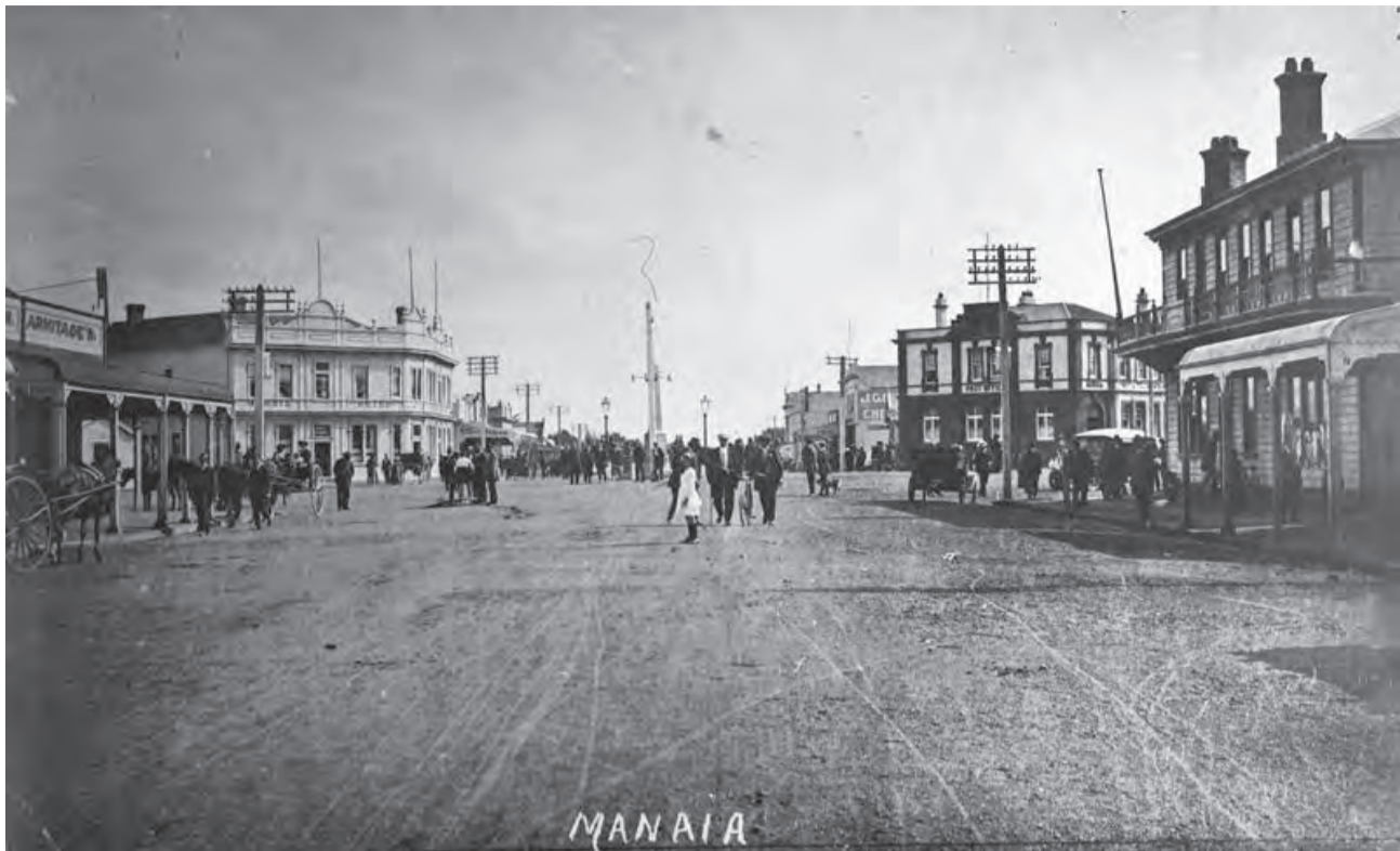
Manaia before World War I

The two-storeyed Post Office building on the right of the photo would have been recently put up, with living quarters for the postmaster in the second storey. Although it's been a long time since it was last used as a post office, the building is still there. The same can not be said for