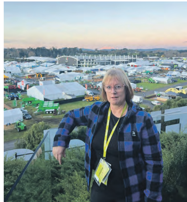
Parliamentarian Barbara Kuriger at an earlier Fieldays.

At its heart, Fieldays is a reminder that New Zealand farming still leads the world. Not because it's easy, but because our people are resilient, practical, and keen to teach and to learn. As we walk through the gates this year, we're not just visiting a show – we're backing our businesses, our communities, and the future