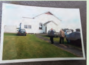
Hall was centre of the community. Page 6