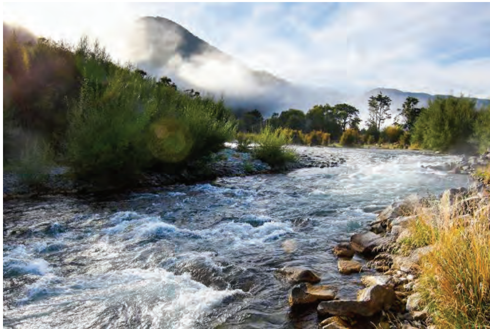
The Government is rapidly running out of time to fix a broken freshwater system.

With today marking six months until the next election, Federated Farmers says the Government is rapidly running out of time to fix a broken freshwater system.