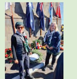
Heating feature pages 22-25