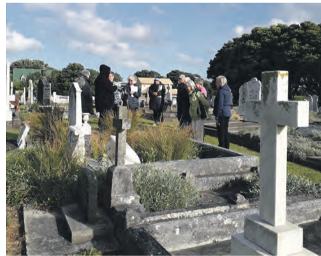
The Hawera Genealogy and Local History Group visit the Opunake Cemetery.