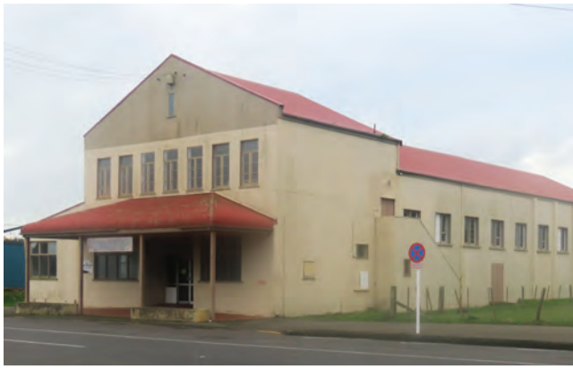
The Manaia District War Memorial Hall (above) and Sports Complex(below). Going, going...