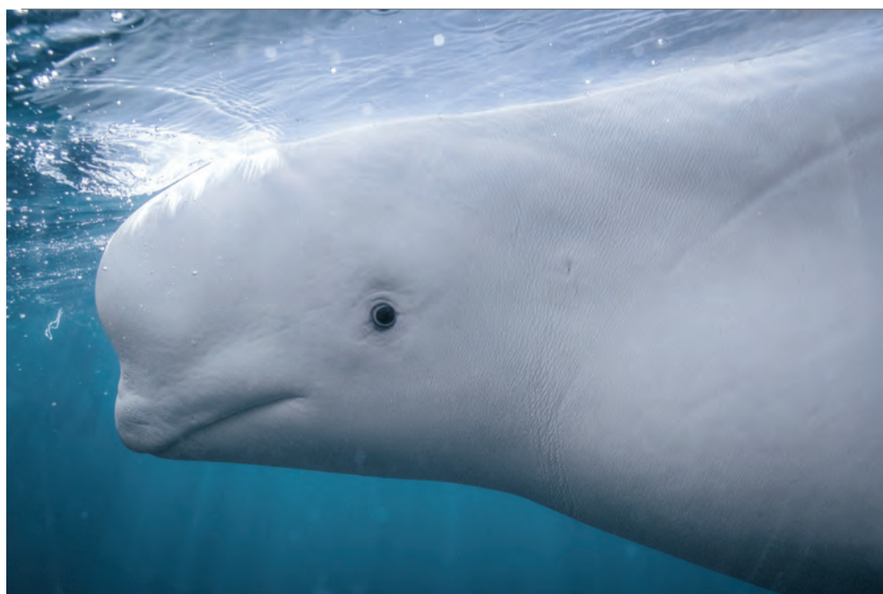
A Beluga whale.