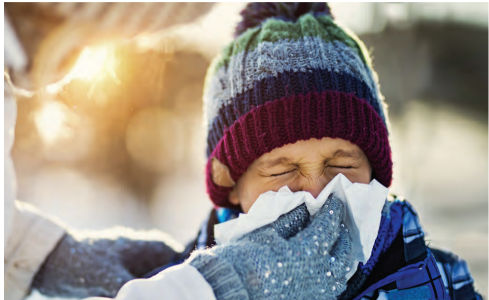
Keeping homes warm and dry is key to preventing respiratory illness.

providers, pharmacies, urgent care clinics, online GP services, Healthline for free on 0800 611 116 or, in an emergency, your nearest Emergency Department.