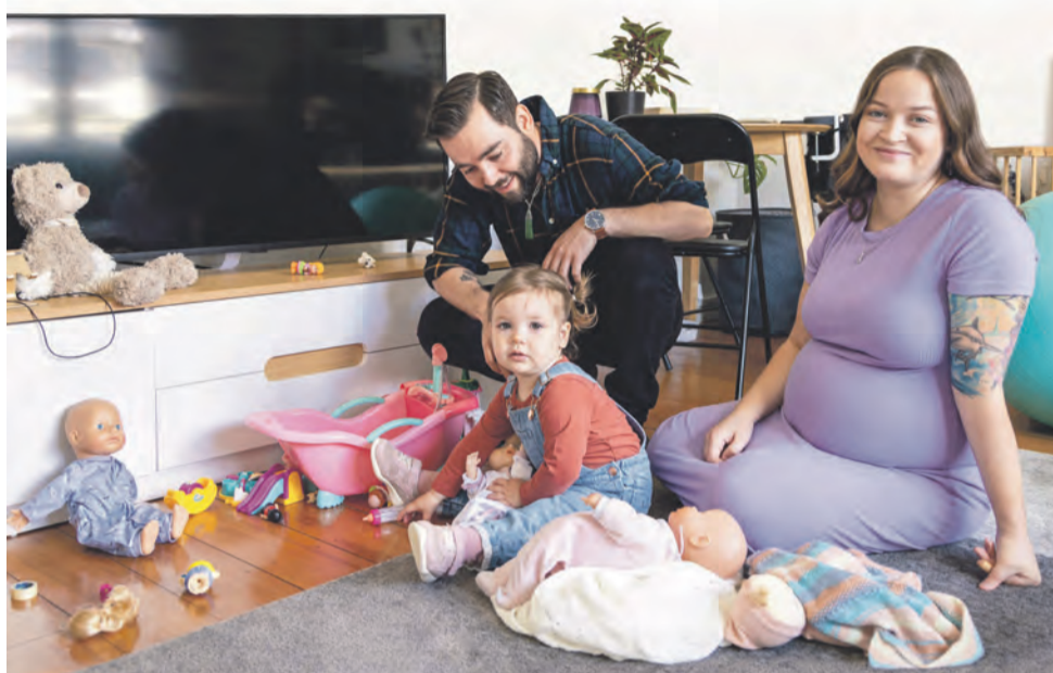
Being immunised is the best way to protect against some preventable diseases.

To further reduce the spread of infectious illnesses: