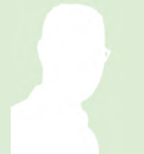
When young people feel alone in a world full of people. Page 10